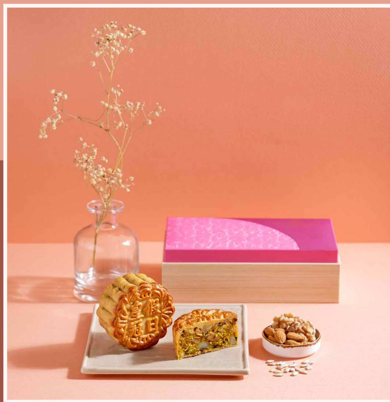
Nyonya Mixed Nuts

Box of 4 - $72 nett | Box of 2 - $46 nett