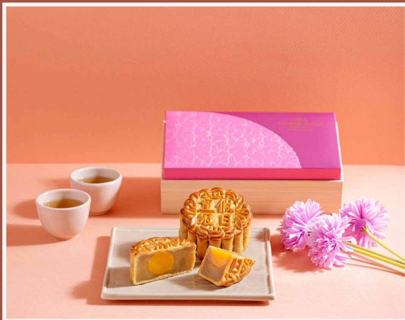
White Lotus Paste with Single Yolk

Box of 4 - $74 nett | Box of 2 - $48 nett