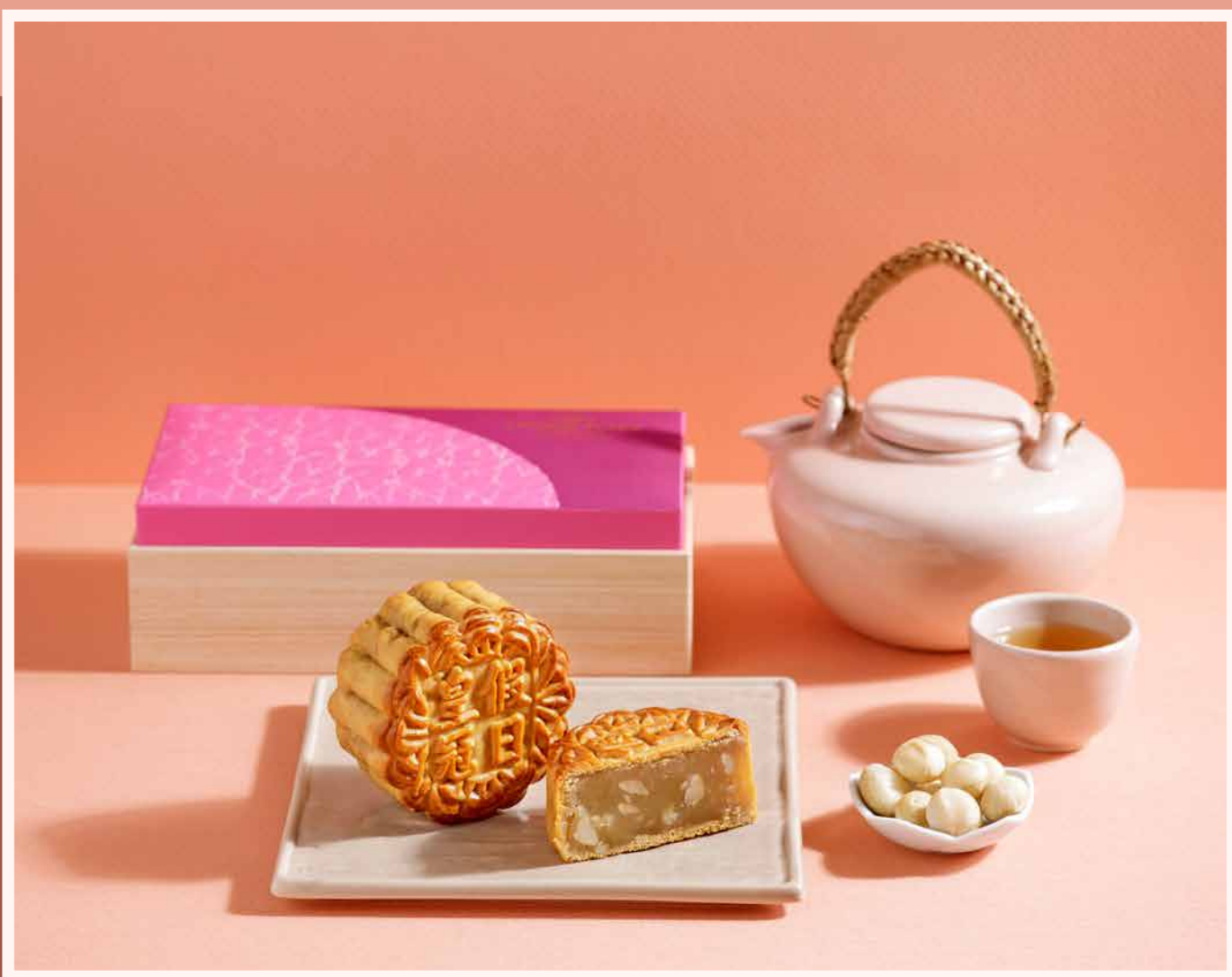
Low Sugar White Lotus Paste with Macadamia Nuts

Low sugar lotus paste filled with macadamia nuts for a satisfying crunch in every bite.