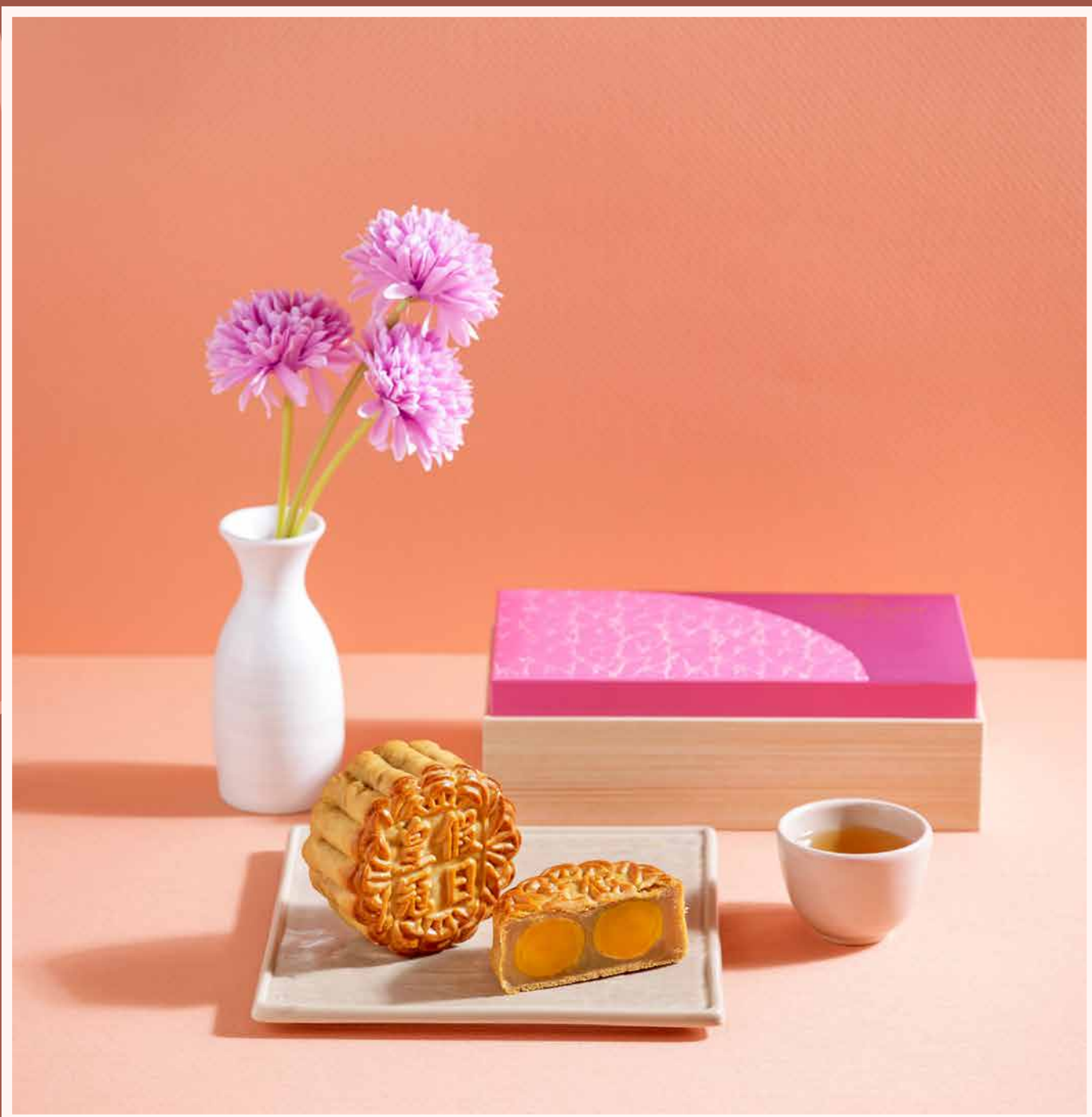
White Lotus Paste with Double Yolk

Box of 4 - $74 nett | Box of 2 - $48 nett